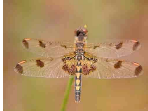
Calico Pennant Celithemis elisa

The DNR Nongame Program, annually, produces a poster to promote the Nongame Tax Checkoff and to educate the public about some Nongame critter of interest in Minnesota. This year they plan to do a dragonfly poster which will also help promote the MOSP!