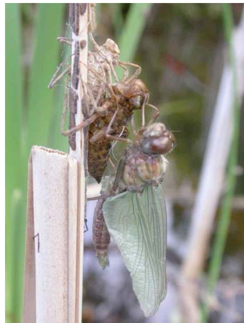
A teneral Lake Emerald ( Somatochlora cingulata) hanging from a soon-to-emerge larva hanging from an exuvia.

If anyone would like more information about the Chippewa NF inventory work, I have a detailed Forest Service report that I would be happy to share. I can be reached at: jslind@frontiernet.net or 218-834-3199.